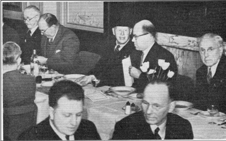
The Old Timers' Dinner, held in London on May 20 last. At the top table, left to right : G6UT , G6CL, G2NM (Chairman), G6F0 and VE6HM. The OT's present totalled 78.