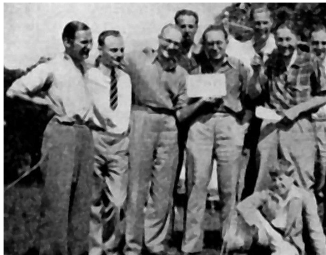
1939 NFD: G5RVP at Danbury Common T&R Bulletin July 1939