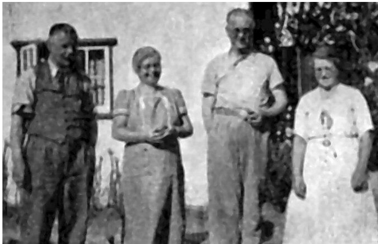
1939 NFD: G6UTP at Abbess Roding - and hostesses with G6UT and G3SI T&R Bulletin July 1939