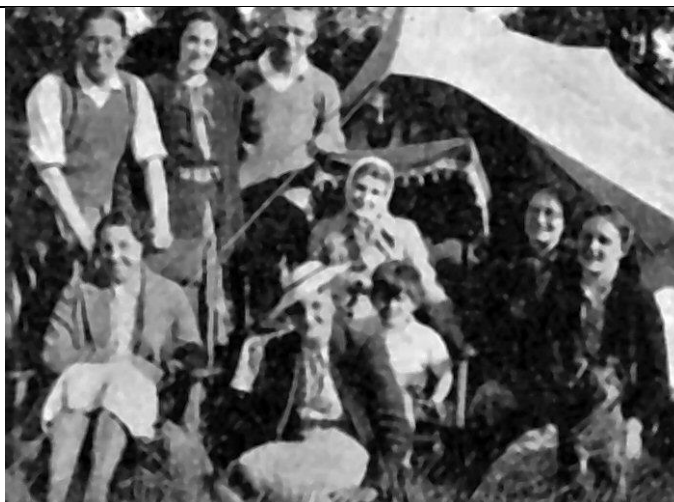
1939 NFD: G8ABP at Tye Green T&R Bulletin July 1939