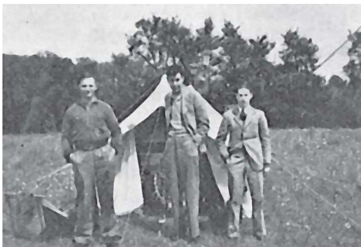
1938 NFD: G8ABP near Harlow T&R Bulletin July 1938

members were not interested in the 1.7 Mc/s band!". This was despite a plea for additional operators in the April edition of the T&R Bulletin.