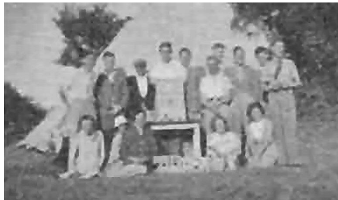
1937 NFD: G6UTP and G5UKP T&R Bulletin August 1937

1938: There were some changes for 1938. The Chelmsford Group operated as G6LBP on 1.7 Mc/s again, this time from Fairmead, Bicknacre, using G6LB's equipment. G6UTP was on 3.5 Mc/s from Rookwood Hall, Abbess Roothing. G5UKP operated on 14 Mc/s from Thundersley Glen using G5UK's transmitter which worked well on 7Mc/s the previous year. G6QK was in hospital so G8AB took over and operated as G8ABP on 7 Mc/s from "The Rainbow and Dove", Hastingwood Common near Harlow.